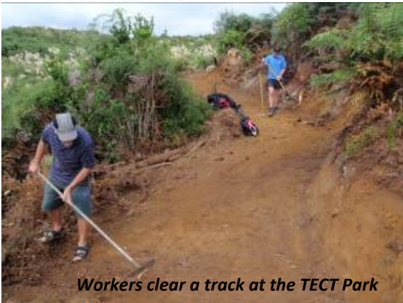
Workers clear a track at the TECT Park

The Western Bay of Plenty District Council and Tauranga City Council purchased about 1255 hectares of land, mostly in forest and native bush, between Tauranga and Rotorua with the